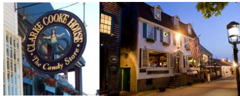
Clarke Cooke House Restaurant