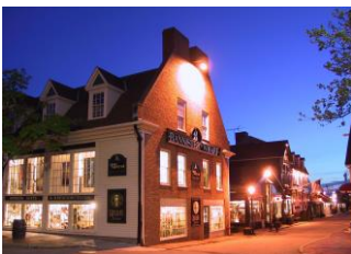
Office, 1 Bannister's Wharf, 3 rd Fl.