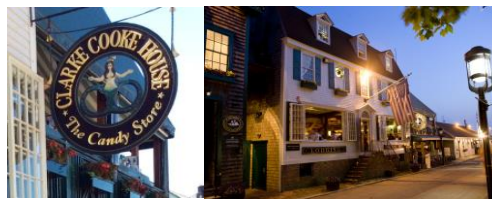
Clarke Cooke House Restaurant