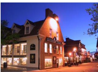
Office, 1 Bannister's Wharf, 3 rd Fl.