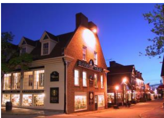
Office, 1 Bannister's Wharf, 3 rd Fl.